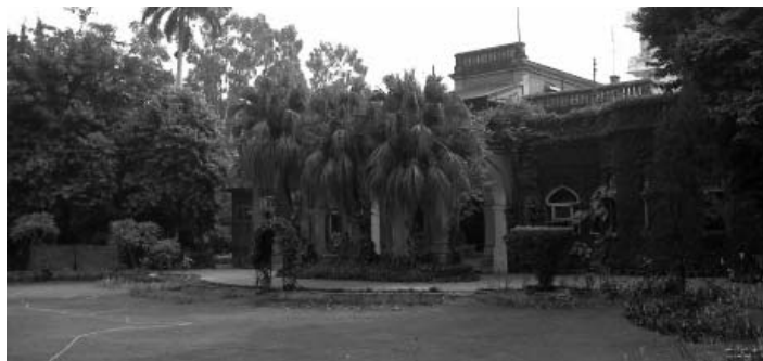
Griffin's final Lucknow residence

first reading the obituary, but in 2006, taking the announcement as an emphatic cue, I made inquiries with colleagues at Lucknow's College of Architecture. "Of course," a senior professor matter-of-factly responded, "there is a Walter Burley Griffin memorial in Lucknow!" He even generously offered to take me to it. Much to my surprise we soon found ourselves standing in front of the University's Tagore Library, the very building that Griffin had come to India from Australia to build. Just as I was beginning to think the professor had misunderstood my question, he turned and pointed to a small temple-like structure a stone's throw away from where we were standing. Tellingly embellished with a cross, the "Indo-deco" concrete structure certainly appears to have been constructed, like the library, in the 1930s. Speaking as we walked across to the memorial, my host elaborated that a metal plaque attached to its base recorded Griffin's name and birth and death dates. Sadly, upon closer inspection, we found not a plaque, but only bolt holes: someone had stolen it—rendering it very difficult, if not impossible, to state with certainty that this was the outcome of Indian Wildlife's initiative.