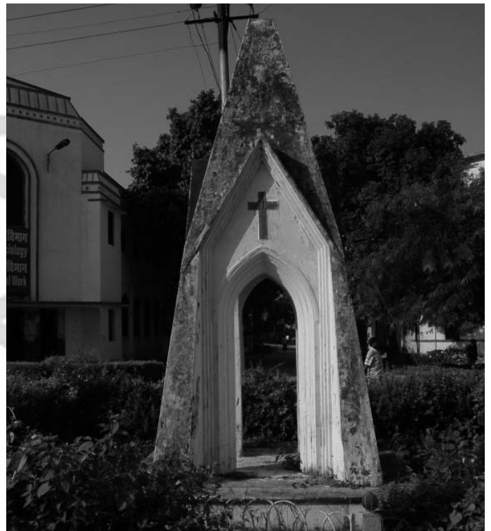
Walter Burley Griffin Memorial in Lucknow