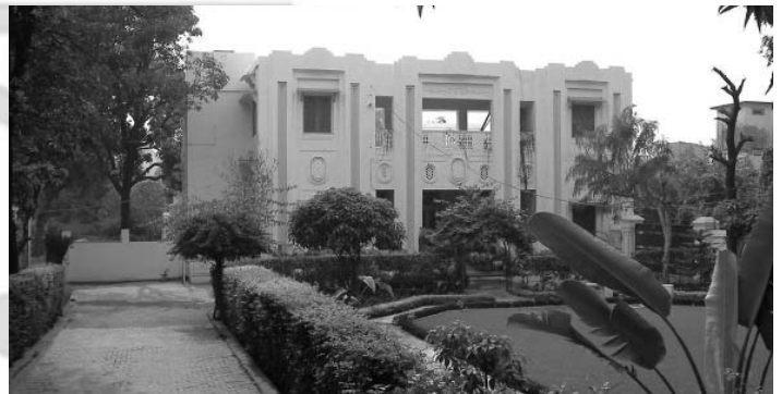
University of Lucknow Faculty House